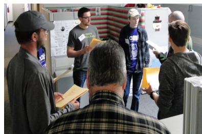
Together, MAGIC volunteers gave over 1,500 hours of their time!