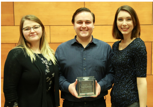
2018 Hackathon Winners (Best Design) HealthMe app