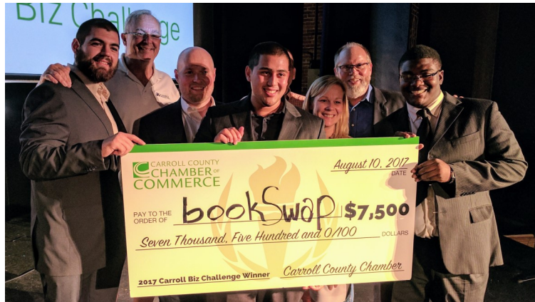
2017 Chamber Biz Challenge Winners Bookswap