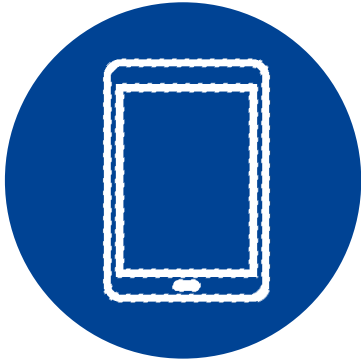
Medical interface tablets