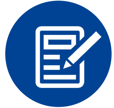
Pen and paper

All rely on manual data entry that is tedious, time-consuming, and redundant.